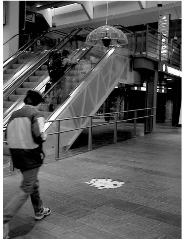
Figure 4. Loudspeaker with parabolic reflector, foil on the floor marking the centre spot.

In the transit area, sixteen speakers with parabolic reflectors were hung from the ceiling at a height that made the focal area approximately ear-height for the average listener. The reflectors were made from clear plastic for reasons of security cameras, and on the