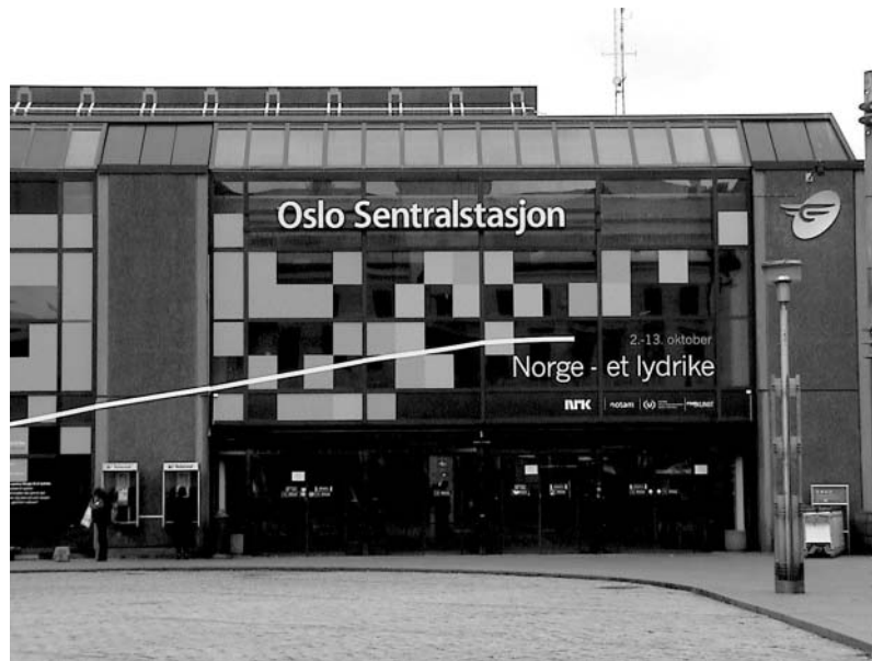
Figure 1. The façade of the rail station during the period.

installation displayed some of the man-made environments, actions or natural sounds that bring unity and identity to the Norwegian culture.