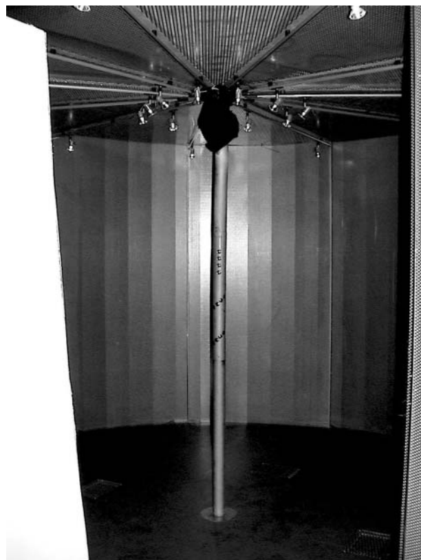
Figure 2. The listening room, with the centrally placed controller.

In order to make a production of this size in Norway, collaboration is required for both financial purposes and practical reasons. NOTAM was responsible for the curatorial idea and the commissioning of artists for the sound content of the listening room and radio broadcast. NRK was responsible for recording and streaming the sound material into the installation, as well as the construction of the listening room and the mounting of sound-showers, projection and lighting equipment. Asbjørn Flø designed the interior shape of the listening room as well as the controller. The graphic design program was developed by NRK, in close collaboration with NOTAM. The whole front of the rail station was decorated, and printed foils were placed on the floor directly below each sound shower. The outside of the listening room was ‘decorated’ with project information.